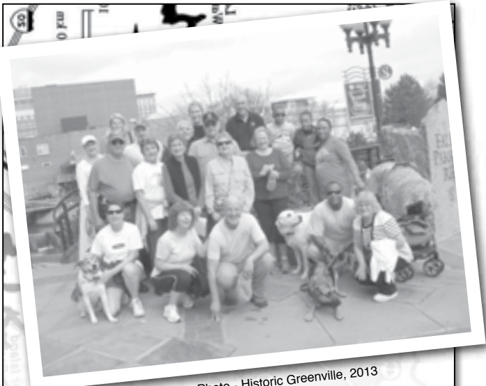
UpState Pathfinders Group Photo - Historic Greenville, 2013

People of all ages, abilities and "walks" of life take part in our club programs and events. Our emphasis is on walking for health, physical fitness, pleasure, and fun. All members take part in planning and overseeing our volkssport events.